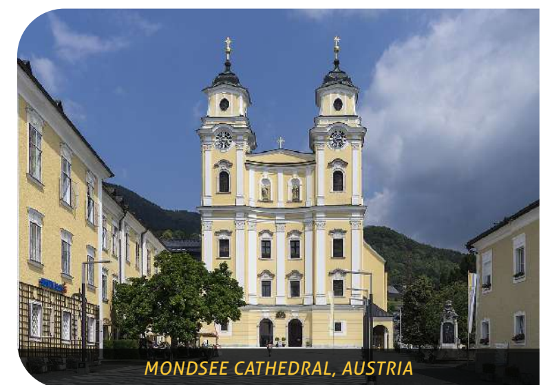
MONDSEE CATHEDRAL, AUSTRIA