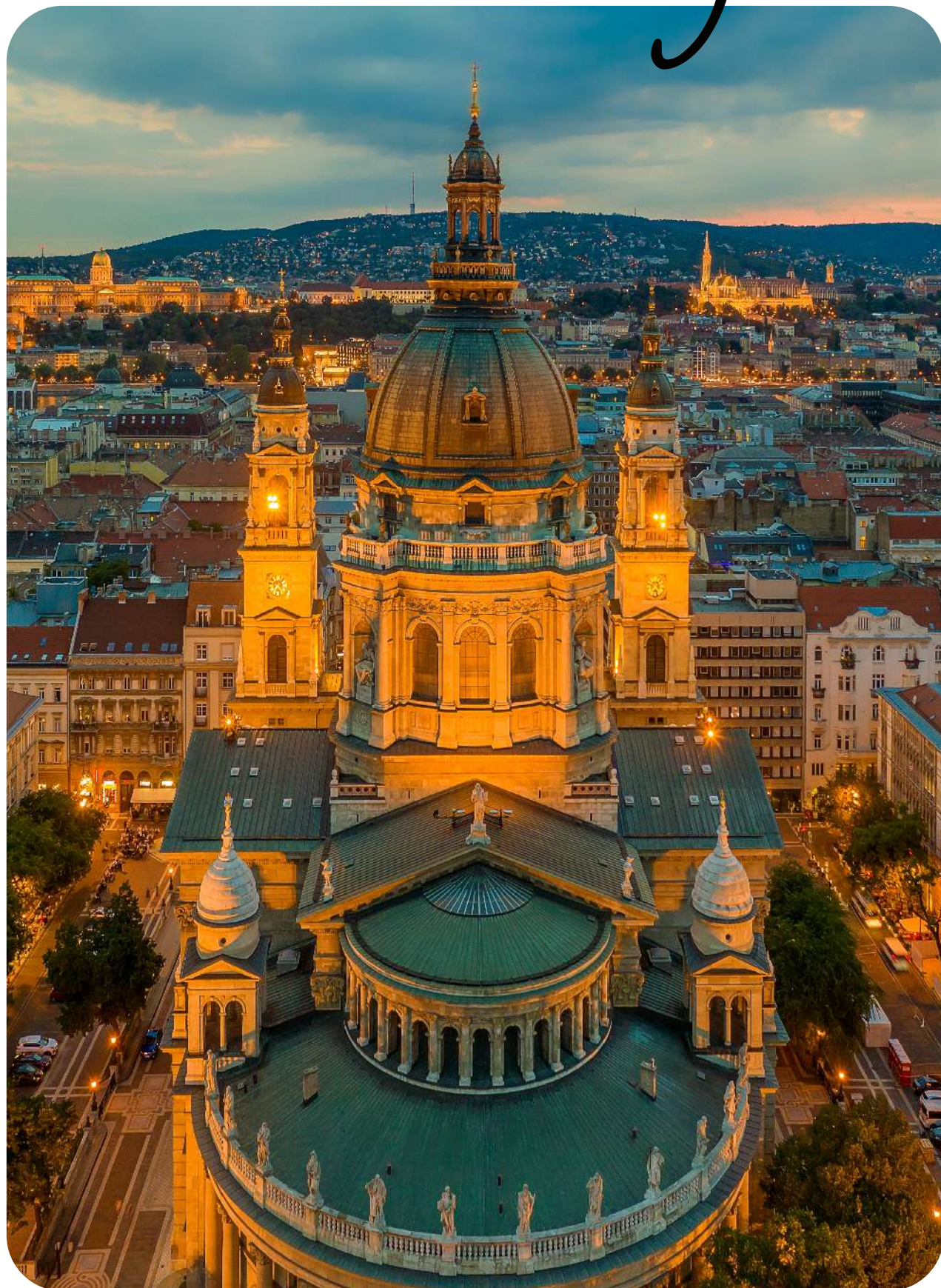
BUDA CASTLE, BUDAPEST