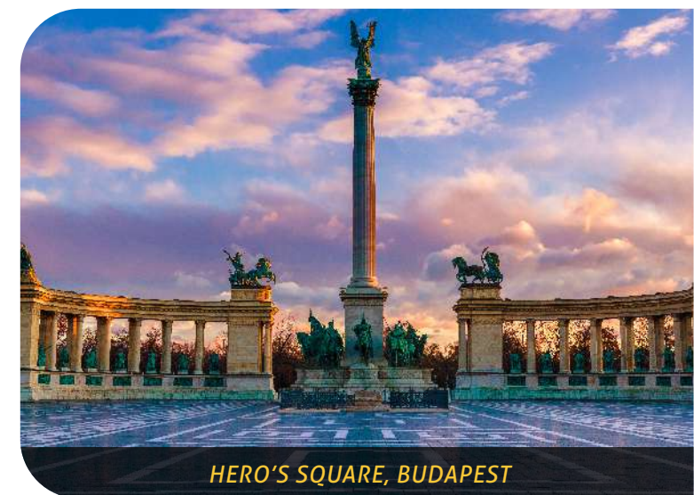
HERO'S SQUARE, BUDAPEST