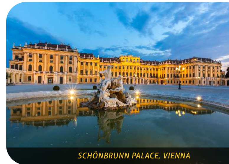
SCHÖNBRUNN PALACE, VIENNA