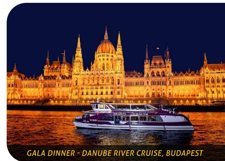
GALA DINNER - DANUBE RIVER CRUISE, BUDAPEST