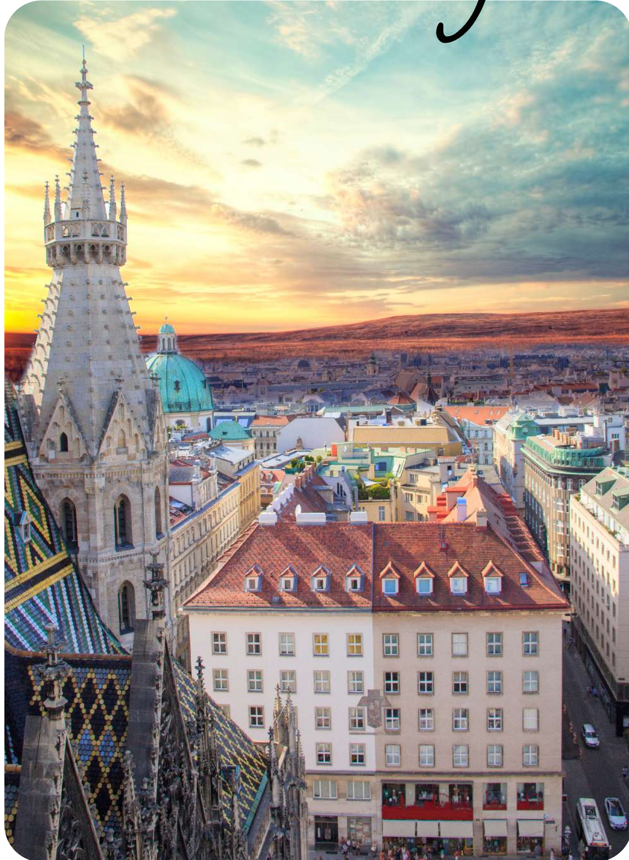
ST. STEPHEN'S CATHEDRAL, VIENNA