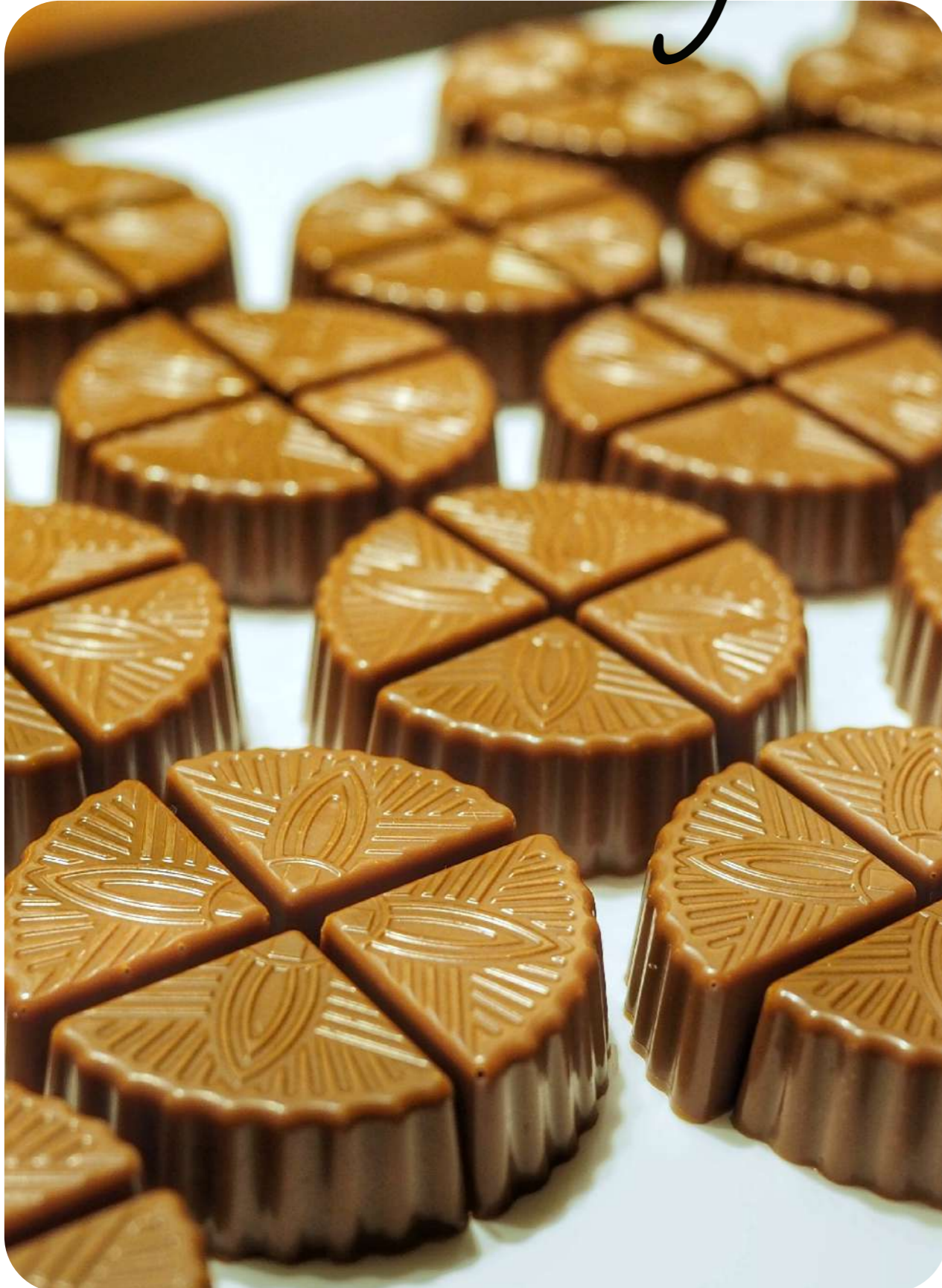
CAILLER CHOCOLATE FACTORY, BROCC