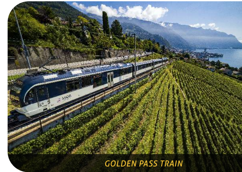
GOLDEN PASS TRAIN

Overnight in Lake Geneva Region (B, L, D)