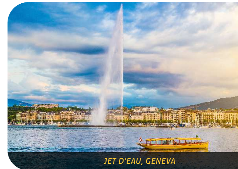
JET D'EAU, GENEVA