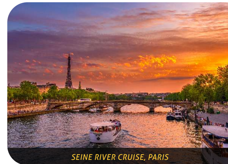
SEINE RIVER CRUISE, PARIS

Today, proceed to Disneyland Paris, where you can visit Disneyland Park OR Disneyland Studios. Get charmed by Cinderella's Castle, take an exciting roller coaster ride down the Thunder Mountain, meet Alice in Wonderland, Pinocchio and others in Fantasyland as well as Aladdin and Indiana Jones at Adventureland. You can also ride a space shuttle to the moon at Discovery land and much more. Overnight in Paris (B, D)