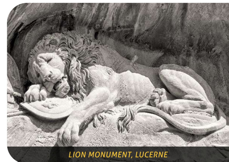
LION MONUMENT, LUCERNE