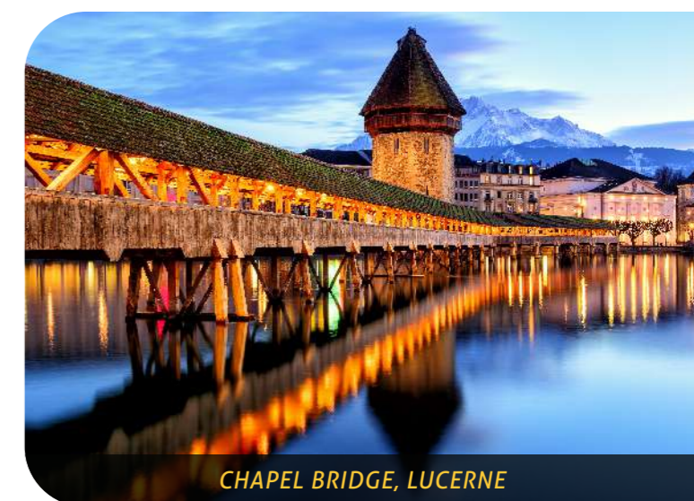
CHAPEL BRIDGE, LUCERNE