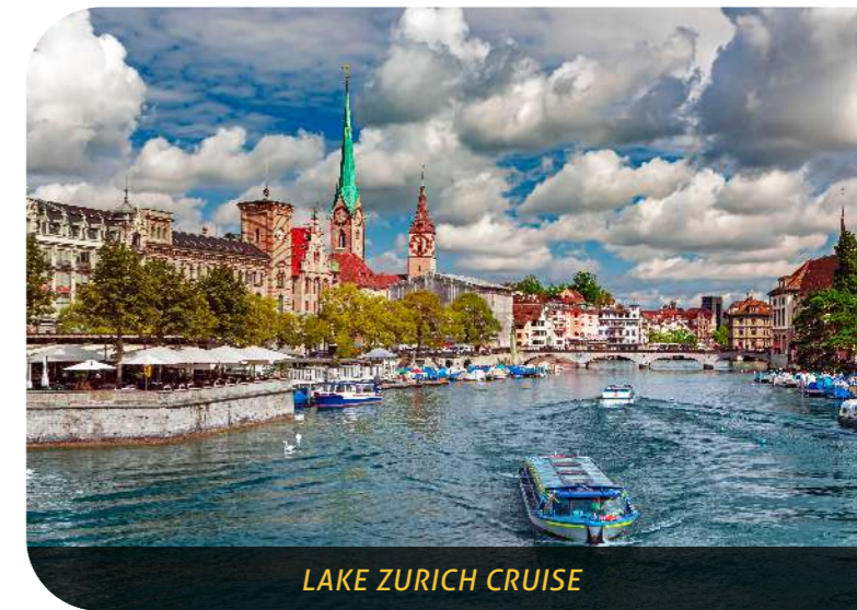
LAKE ZURICH CRUISE