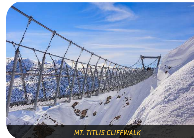
MT. TITLIS CLIFFWALK