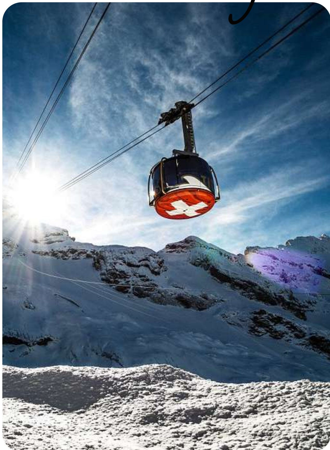
MT. TITLIS. ROTAIR