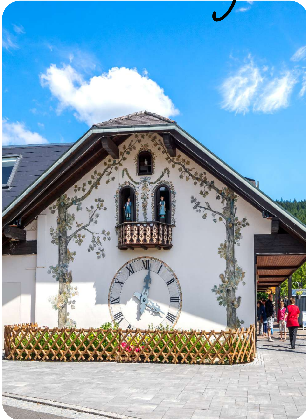
CUCKOO CLOCK, TITISEE