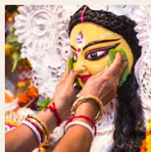
Durga Puja (Kolkata)