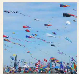
Kite Festival (Jaipur)