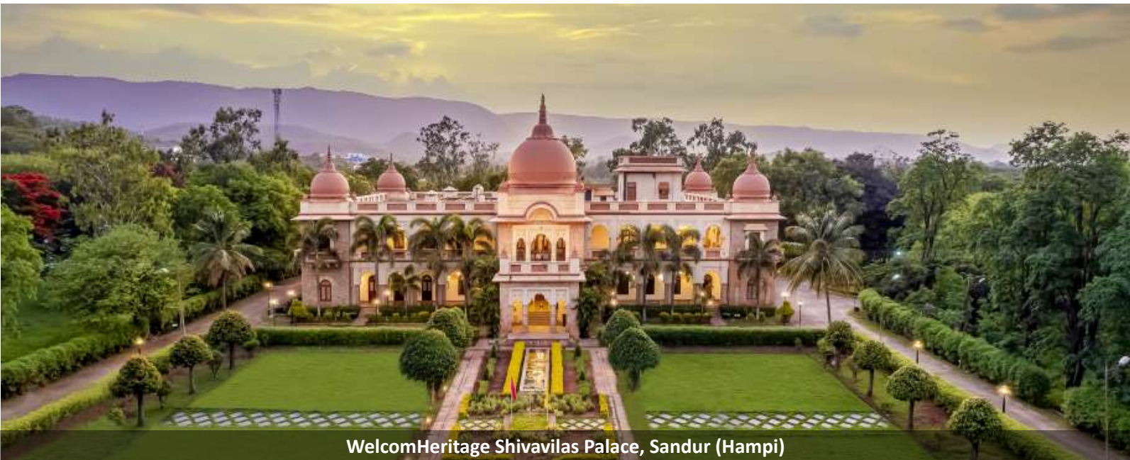
WelcomHeritage Shivavilas Palace, Sandur (Hampi)

WelcomHeritage has adapted and evolved over the years into an “Experiential Brand” incorporating Culture & Heritage and folded in the Natural Heritage components of being close to Nature, Wildlife and Wellness as they truly represent India’s bounty of authentic offerings. Correspondingly, we now have a 50:50 split with Nature, Wildlife & Wellness resorts at varied destinations, coupled with our focus on Heritage Palaces, Forts & Havelis with an eye to attract travelers from outside India.